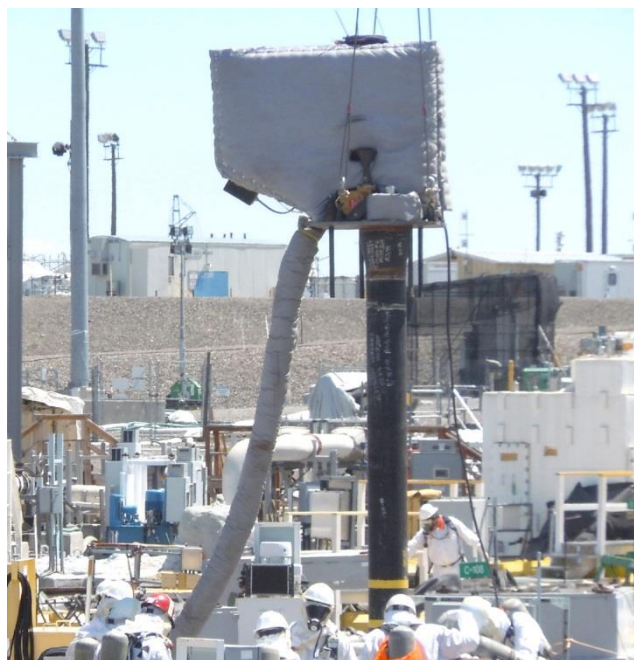
Workers install a new slurry pump in tank C-111 earlier this year to allow waste retrievals to continue. Retrieval activities were completed at the end of March. C-111 is the 15 th of 16 tanks in Hanford’s C Farm to complete retrieval activities.