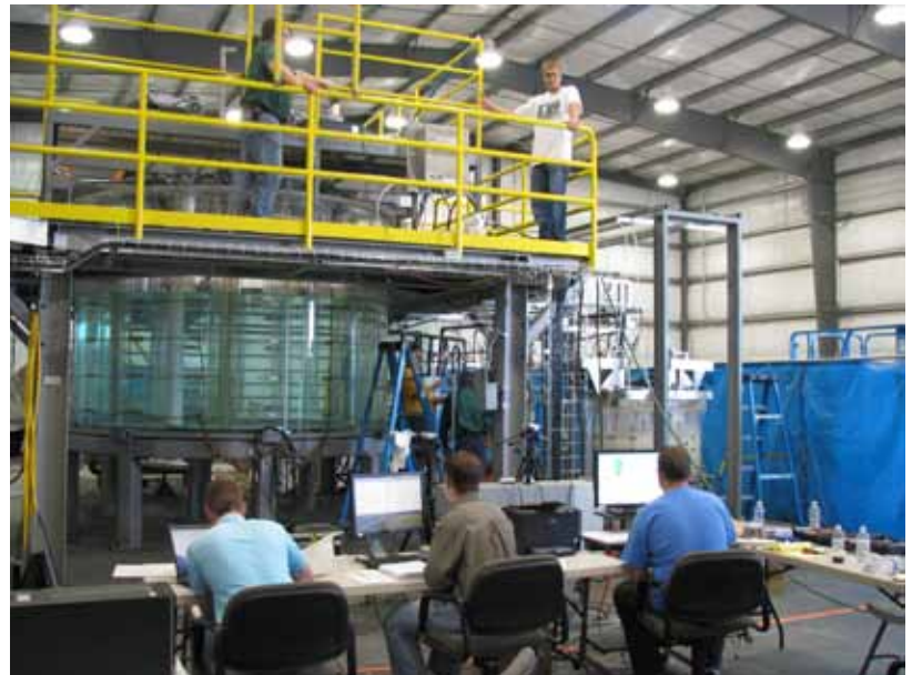
A scale model mixing tank is one of several pieces of equipment used to test the tank farm waste-delivery system. Tests are designed to ensure the high-level radioactive tank waste can be safely and reliably mixed, sampled and transferred to the Waste Treatment Plant.

In response, DOE's implementation plan calls for WTP to conduct large-scale waste mixing tests using pulse-jet mixers and for WRPS to perform small-scale tests to define the tank waste mixing, sampling and transfer system performance capabilities. The resulting data will be used to perform a gap analysis comparing the tank farms waste-feed delivery capabilities with the WTP Pretreatment facility's waste-feed receipt system capabilities.